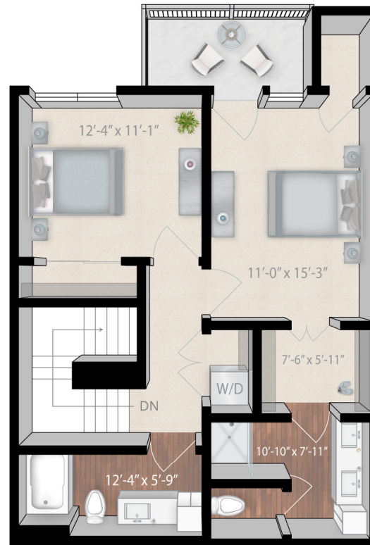
Level 1 (2-story)